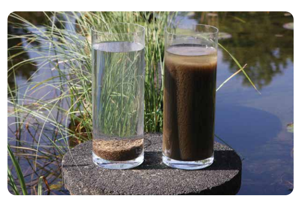
SVI<sub>5</sub> comparison of aerobic granular sludge (left) and conventional activated sludge (right)