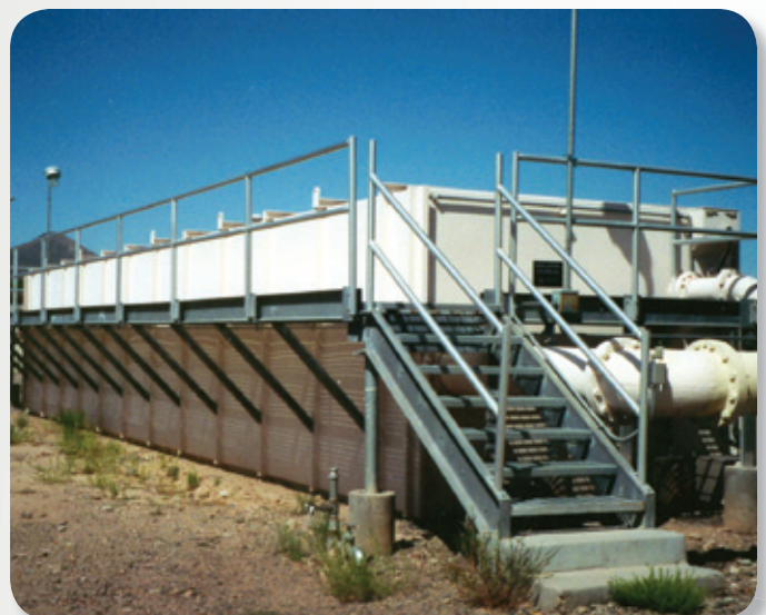
AquaABF ® package filters are ideal for both municipal and industrial water or wastewater treatment applications.

AquaABF package filters are available in a variety of sizes, ranging from 4 ft. x 8 ft. (1.2 m x 2.4 m) to 9 ft. x 40 ft. (2.7 m x 12.2m), and are available in both painted steel and stainless steel.