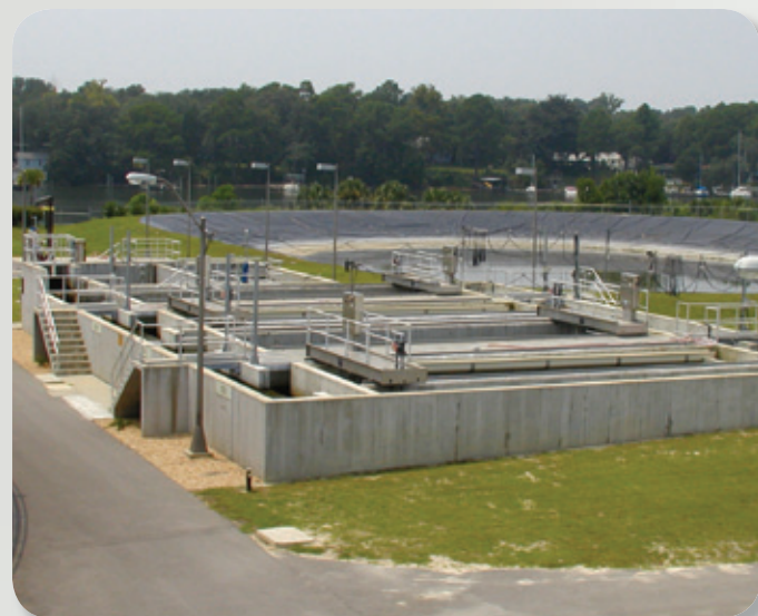
Four AquaABF ® concrete filters installed as part of this plant's upgrade to meet required effluent TSS and phosphorus levels.

AquaABF concrete filters are available in standard widths of 6, 9, 12.5, and 16 ft. (1.8, 2.7, 3.8 and 4.9 m), offering site adaptability and cost efficiency.