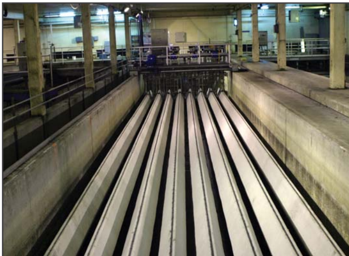
One of Fox Metro's AquaDiamond ® Filters retrofitted into an existing traveling bridge filter tank.

Aurora, Boulder Hill, Montgomery, Oswego, and Sugar Grove areas. To accommodate the growing community, the plant expanded its treatment capacity to an average daily flow of 42 MGD and peak flow of 85 MGD.