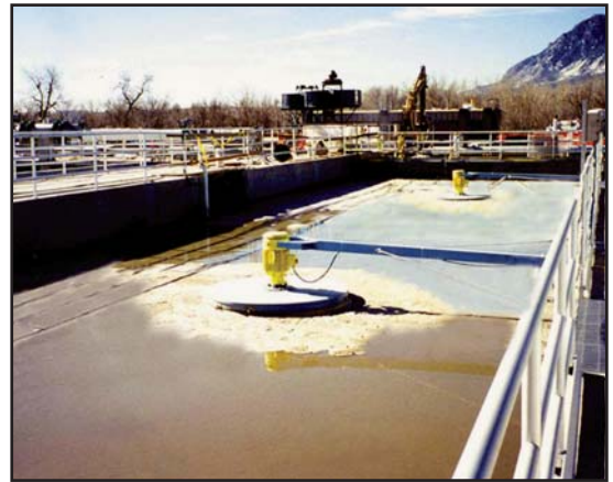
One of five anoxic basins utilizing AquaDDM ® mixers with a pivotal mooring arm.