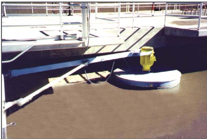
AquaDDM ® mixer with a pivotal mooring arm can be pulled to the port for ease of maintenance.

denitrification, without aeration. The need for tank baffles in the anoxic zones is eliminated due to the AquaDDM mixer's integrated flow vanes and lower input torque.