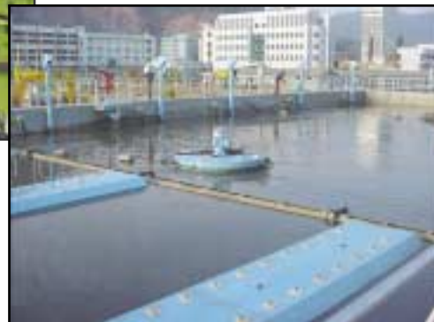
One Aqua MSBR cell at Shenzhen Yantian WWTP. Shown is (1) AquaDDM ® mixer with local control station and (2) Air Weirs.

The plant's treatment scheme includes a pump station, coarse and fine screening, grit removal, the Aqua MSBR system, and a sludge dewatering system. Operation of the entire plant is controlled by a central control system.