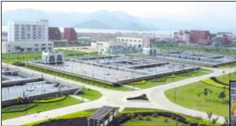
One of three Aqua MSBR reactors at the Shenzhen Yantian WWTP.

Following their investigation of nutrient removal technologies, the city chose to install an Aqua MSBR ® modified sequencing batch reactor system. Plant construction was divided into two discrete phases. The first phase began in early 2000 and the second in December of 2001.