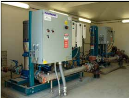
Reuse Pumping Station (Interior)

The water reuse system is designed to handle a maximum daily turf and track usage of approximately 120,000 gpd and a maximum daily sanitary flushing water demand of 35,000 gpd. Signs, color coding and a dye injection system for sanitary flushing water demands at the Casino guards against cross contamination of the reuse water with the potable water system.