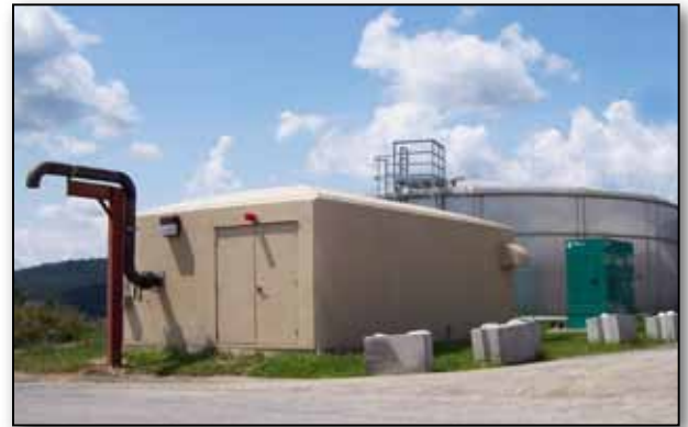
Water Reuse 150,000-Gallon Storage Tank and Main Water Reuse Pumping Station

The sequencing batch reactor (SBR) provides conditions to perform biochemical oxygen demand removal, nitrification, and denitrification (nitrogen removal) to meet NPDES discharge limits. Tertiary filtration is provided by an Aqua-Aerobic Cloth-Media Disk Filter (CMDf) system. Disinfection is provided by chlorination, dechlorination, and cascade aeration. The MTRA WWTF reused approximately 25% of the WWTF flow during the first year of operating the water reuse system; which includes water reuse transfer pump, piping, supplemental disinfection system, and a 150,000-gallon storage tank components for dirt and turf track watering and for flushing water in the complex's restroom facilities. The 150,000-gallon water reuse storage tank and water reuse pumping station are located adjacent to the race course which is approximately 2,500 feet from the MTRA WWTF.