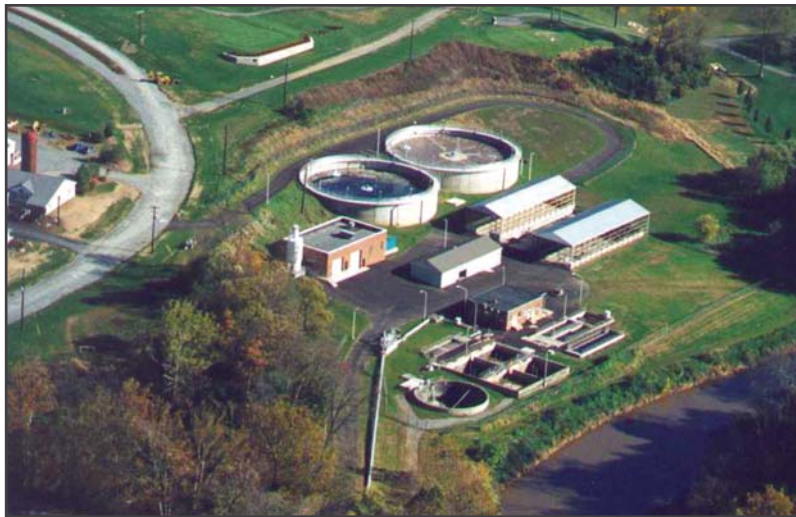
The AquaSBR ® system was constructed adjacent to the existing plant.

Growth of both the college and Borough community resulted in a significant increase in peak hydraulic loading, as well as BOD and ammonia loadings in excess of the plant's design capacity. This prompted an upgrade to the plant in the late 1970s. The upgrade included the installation of a new final clarifier and new influent equalization basin, and replacement of the existing aeration system.