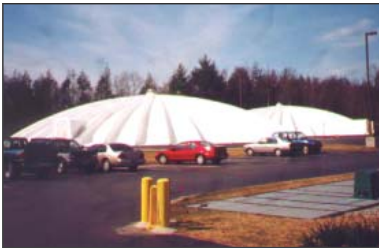
AquaSBR basins #1 and #2 are shown. Basin #3 is located adjacent to these two basins. All the basins have covered tanks.

The AquaSBR was selected because of its ability to handle high strength, peak hydraulic and organic loadings, while consistently providing high quality effluent mandated by the Mashantucket Pequot Tribe Council. In addition, installing the AquaSBR system would allow the Casino's wastewater treatment system to be expanded with minimal cost or disruption.