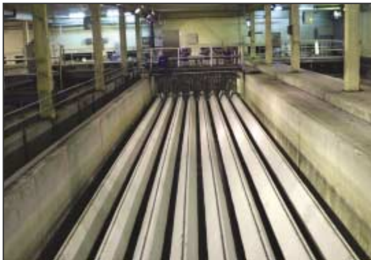
One of Fox Metro's AquaDiamond ® Filters retrofitted into an existing traveling bridge filter tank.

Aurora, Boulder Hill, Montgomery, Oswego, and Sugar Grove areas. To accommodate the growing community, the plant expanded its treatment capacity to an average daily flow of 42 MGD and peak flow of 85 MGD.