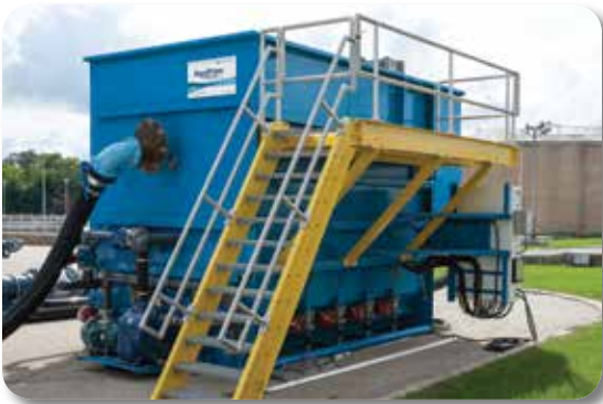
An AquaPrime™ system operating at a municipality for primary treatment.