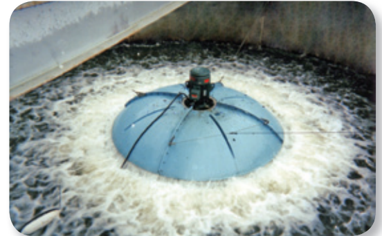
Aqua-Jet II® Aerator in operation.