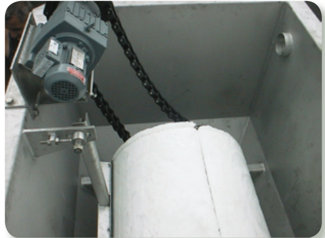
Internal view of an AquaDrum® cloth media filter.