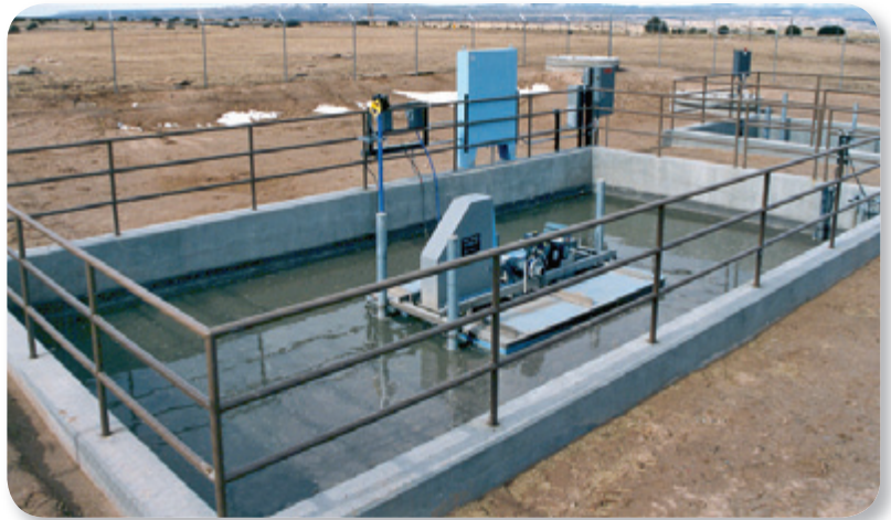
Overview of the AquaCAM-D® unit in a SBR reactor.