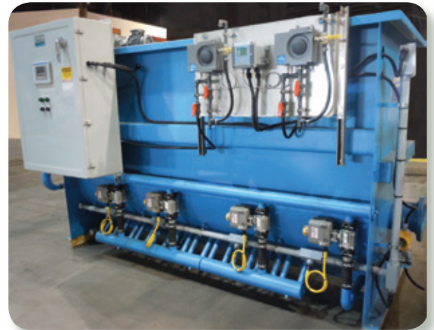
Overview of a 10-disk AquaMiniDisk® unit.