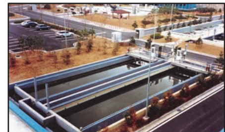
After: Upgraded to Peak Efficiency

When Aqua-Aerobic performs a mechanical assessment, it is followed by a detailed Mechanical Assessment Report defining potential issues effecting filter operational efficiency, capacity, or life expectancy. Many installations are utilizing the Mechanical Assessment Reports as tools to secure funding to perform the needed repairs. An example of an assessment report is available upon request.