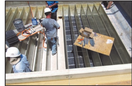
During: Underdrain Repair