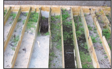
Before: Underdrain Damage