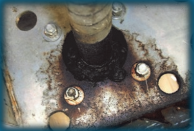
Bearings Leaking Grease