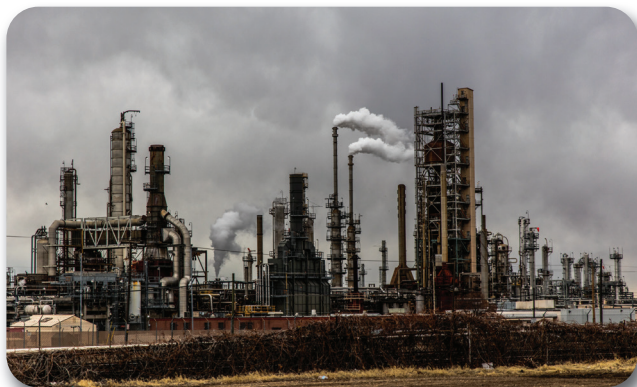
Petrochemical Processing Plant

Because refinery production processes are so diverse, the water utilities that support these processes result in a wide variety of wastewater streams, both from processing streams and non-processing streams like sanitary sewage and storm water. Refinery wastewaters require creative, thoughtful and effective treatment strategies.